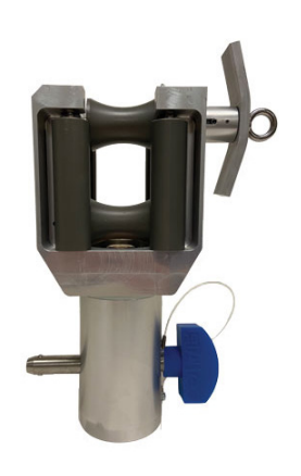
4 in Square to 3 in Round Jib Adapter