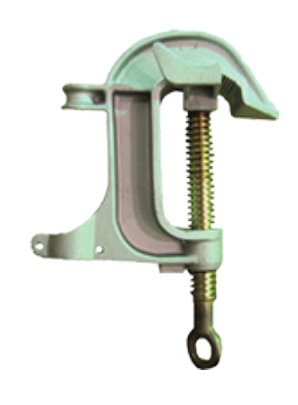
C-Type Clamp for Ground, by Hubbell