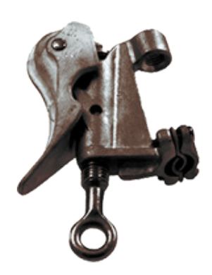
Duckbill-Type Clamp for Ground, by Hubbell