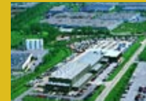
NORTHERN DIVISION Indianapolis, IN