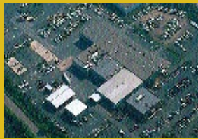
EASTERN DIVISION Plains, PA