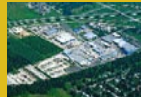
MIDWEST OPERATIONS St. Joseph, MO