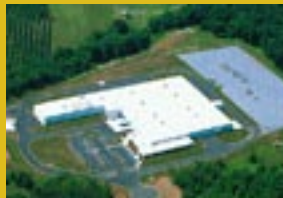
ROANOKE FACILITY Daleville, VA

2106 South Riverside Road St. Joseph, MO 64507-9799 816-364-6348