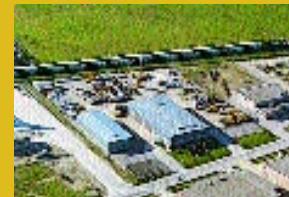
ALTEC LTD. Milton, Ontario

Denver Service Center 641 Telluride Street Aurora, CO 80011-7818 303-364-9515