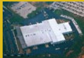
E-TOWN MFG. DIVISION Elizabethtown, KY