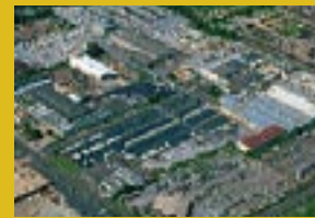
SOUTHERN OPERATIONS Birmingham, AL