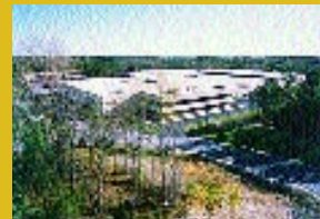
CREEDMOOR MFG. DIVISION Creedmoor, NC