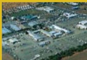
WESTERN DIVISION Dixon, CA